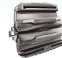
ODYSSEY® MIS Knee Instrumentation