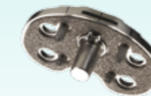
BIOFOAM® CANCELLOUS TITANIUM™ Fixation